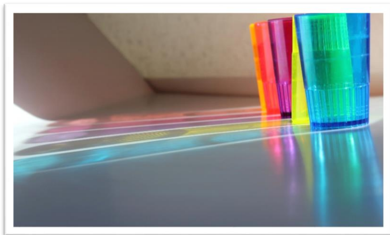
Photo 1 - Light reflected through coloured beakers

Aperture - F/7.1 Shutter speed - 1/160 ISO - 100