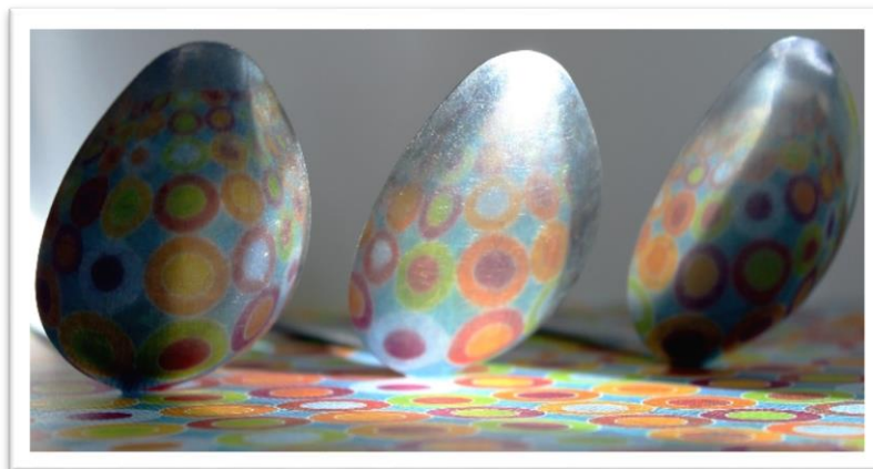
Photo 2 - Wrapping paper reflected on spoons