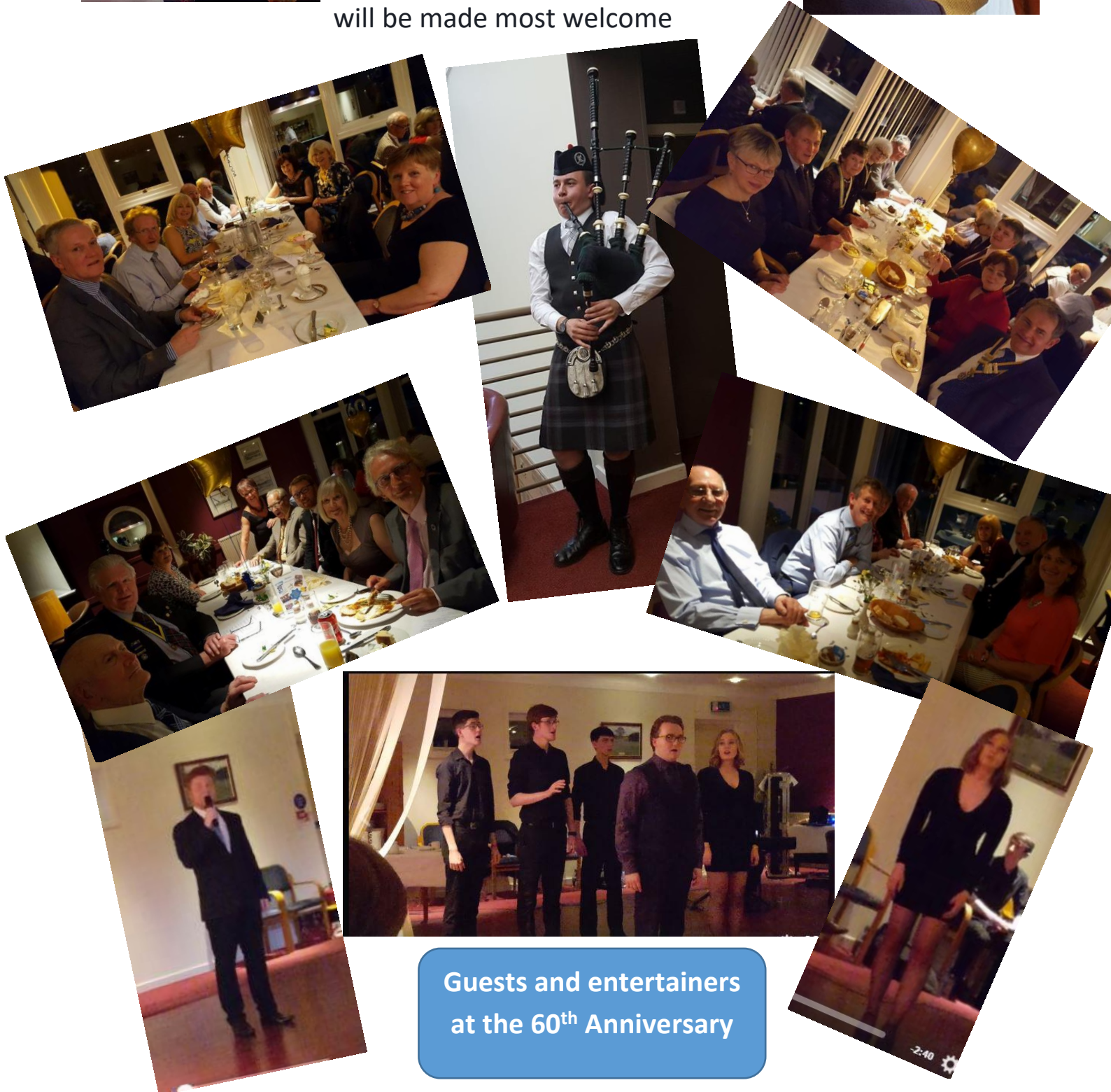
Guests and entertainers at the 60 th Anniversary