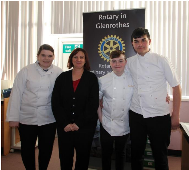
The Auchmuty Team