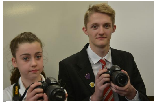
Glenwood High Winners

Well done to all who entered - such talent