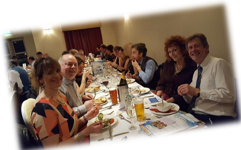
Some photographs from the evening