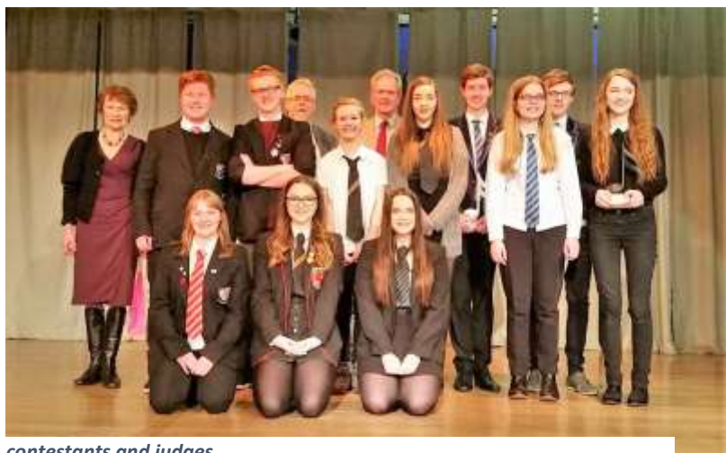
contestants and judges