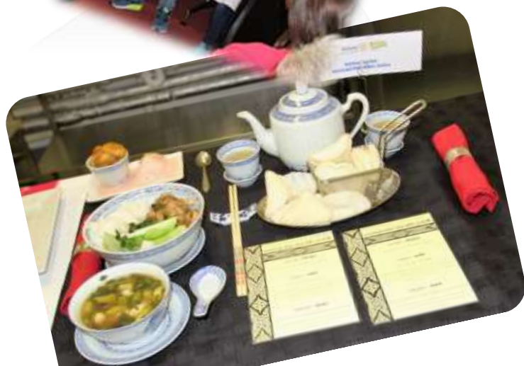
The winning menu