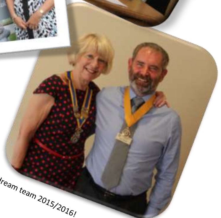
The dream team 2015/2016!