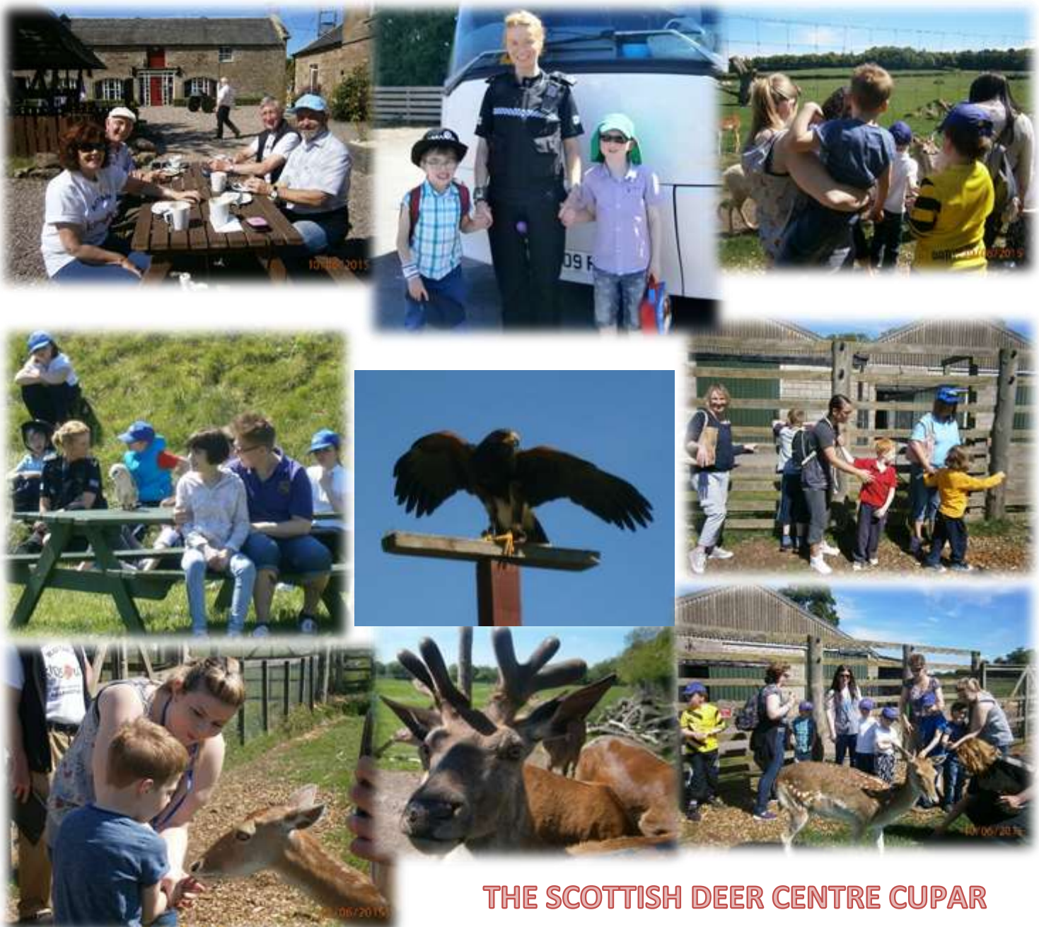
THE SCOTTISH DEER CENTRE CUPAR