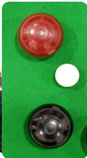
The Brown takes the point!