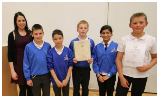
Masterton team with teacher